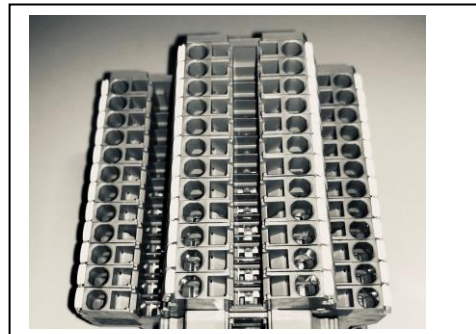
up to 16 double level terminals.